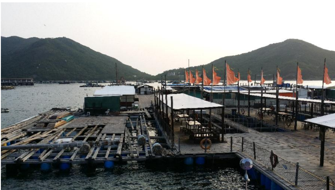
Seafood restaurant row to the left and right of the dock. We ate at Rainbow.