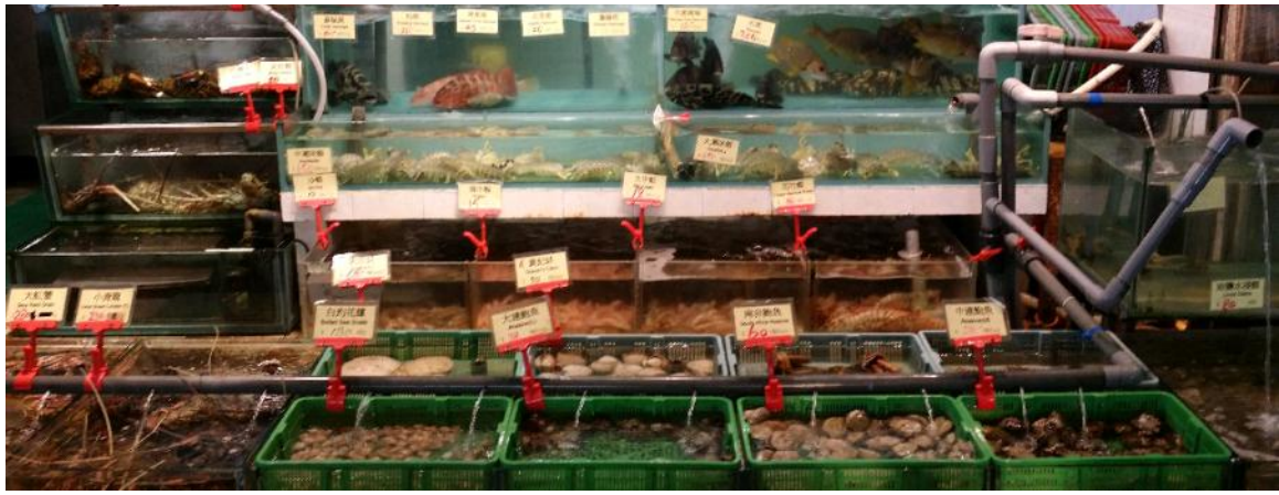
Happily eating once again.